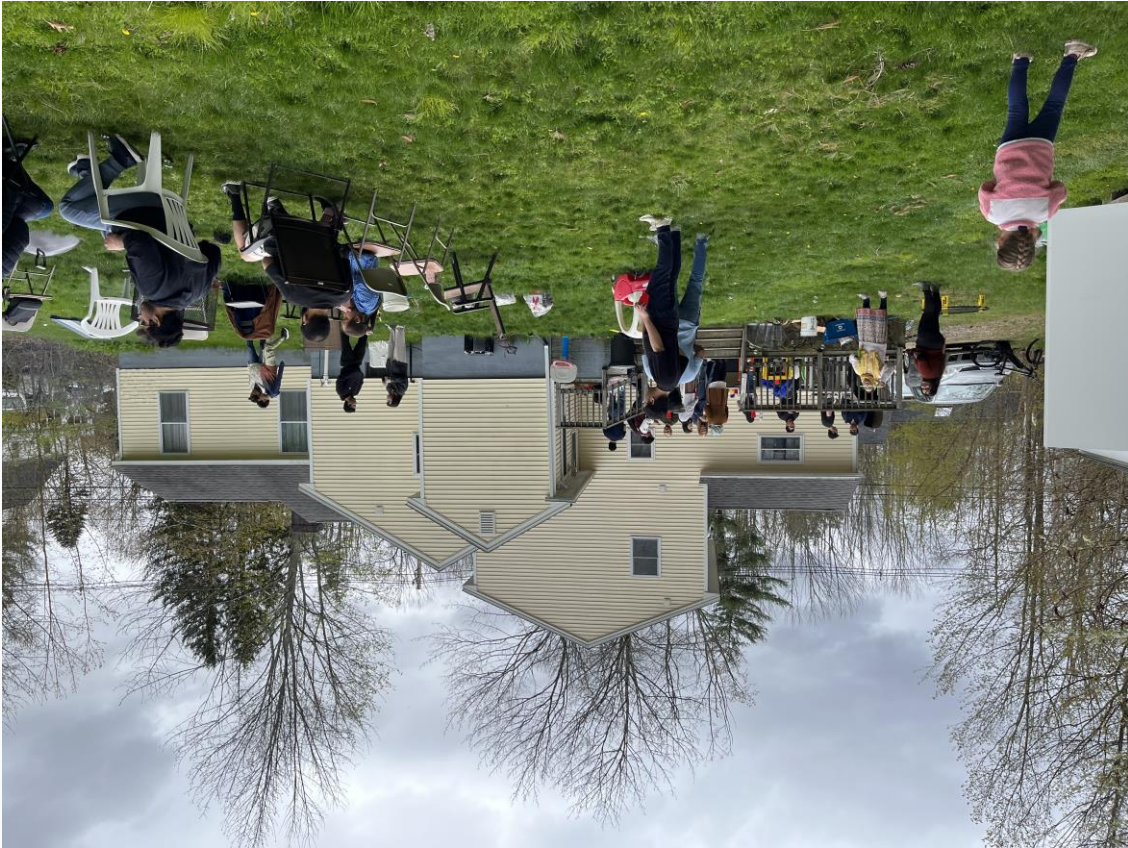
End of Year International Student Celebration at Our House